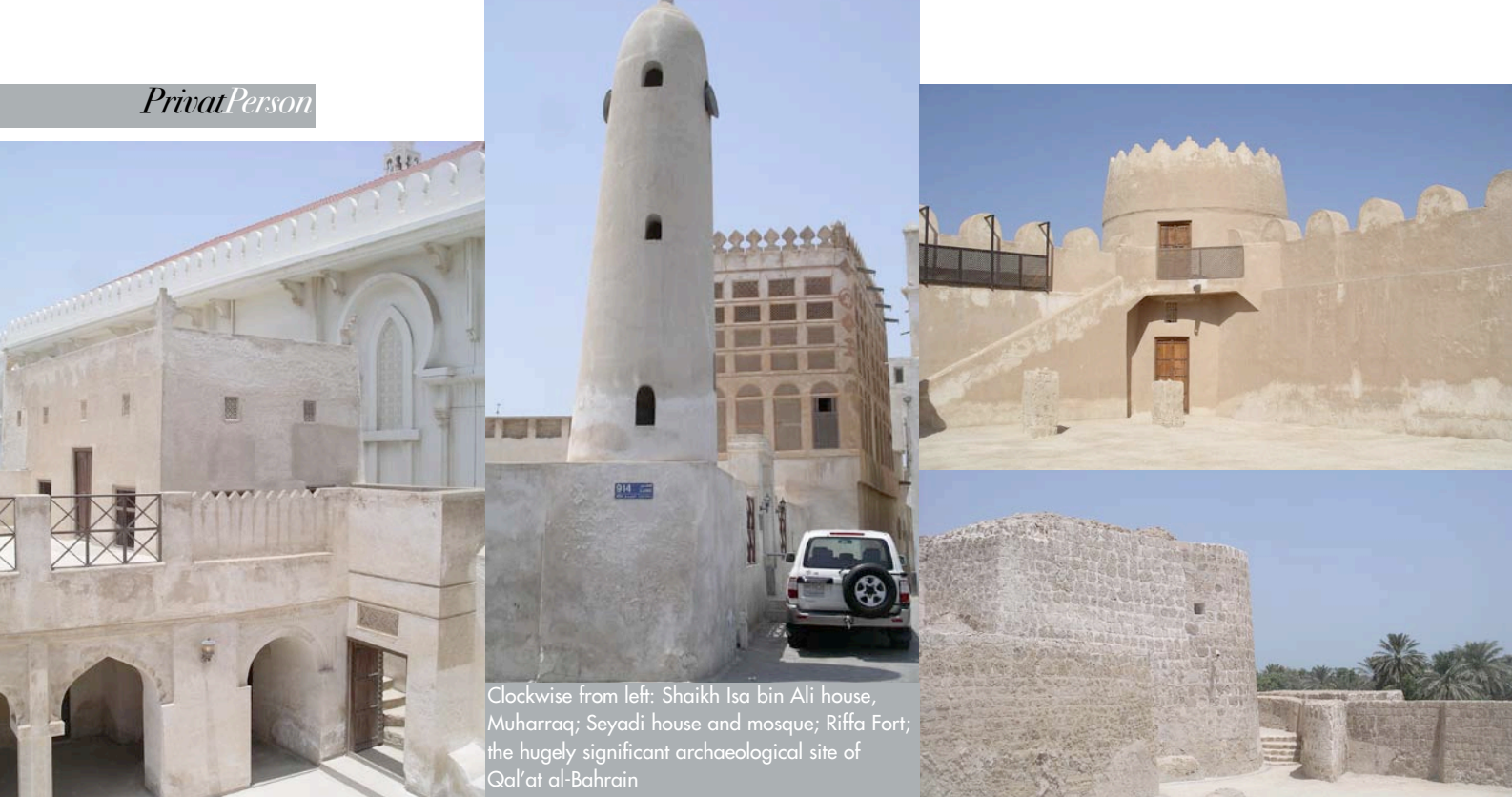
Clockwise from left: Shaikh Isa bin Ali house, Muharraq; Seyadi house and mosque; Riffa Fort; the hugely significant archaeological site of Qal'at al-Bahrain